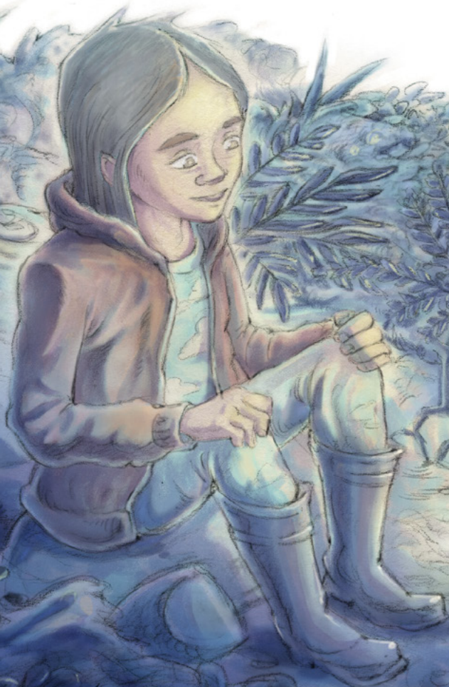
illustration by Kieran Rynhart

As soon as I got home, I fell into bed and drifted into a peaceful, much-needed sleep. My dreams were filled with visions of the kiwi, moving about, gobbling up my worries as if they were wriggling worms.